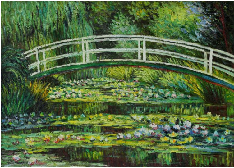
Claude Monet, Bridge Over a Pond of Water Lilies